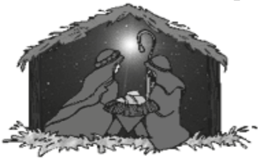
Our Lord and Savior Jesus Christ Was Born