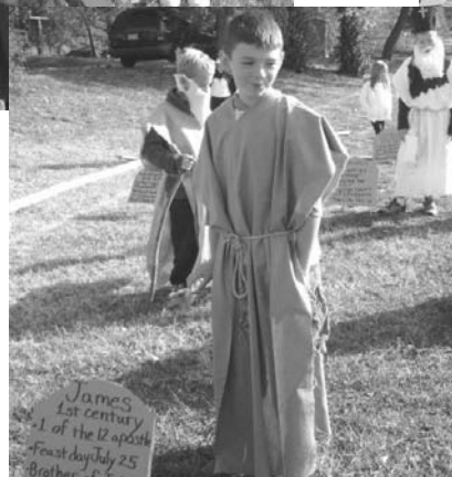
James 1st century -1 of the 12 apostles Feast day July 25 Brother of J...