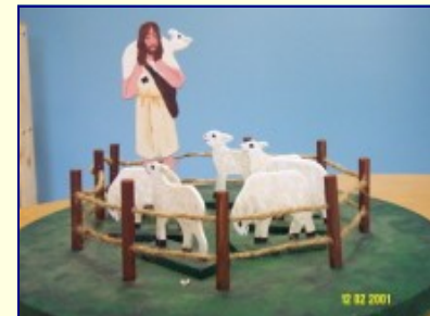
Parable of the Good Shepherd